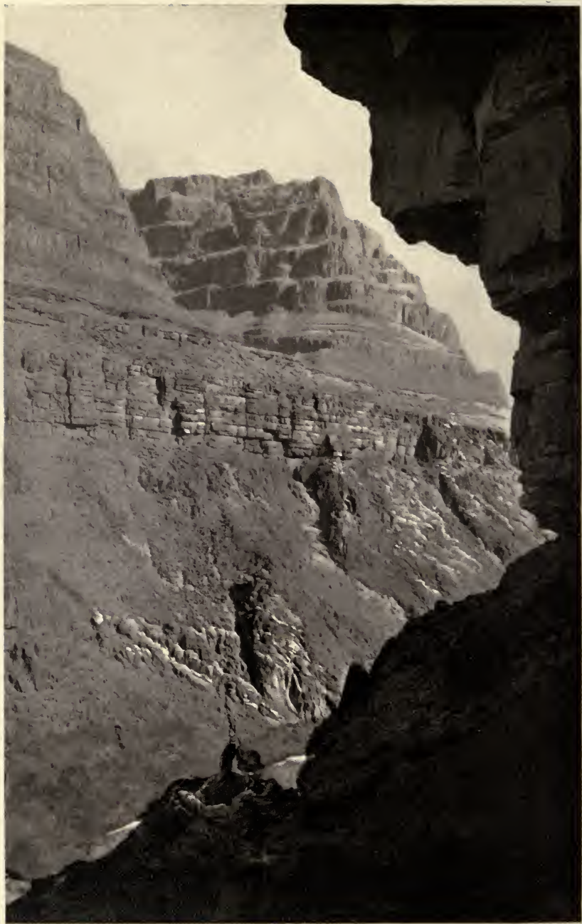
GRAND CANON OF THE COLORADO